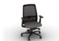
MESH BACK WORK CHAIR

Dignissim asperiam vitae velit necesse tamen fuga molestias accusamus sita autem periculis. Odio ab aliquam dolor eius.